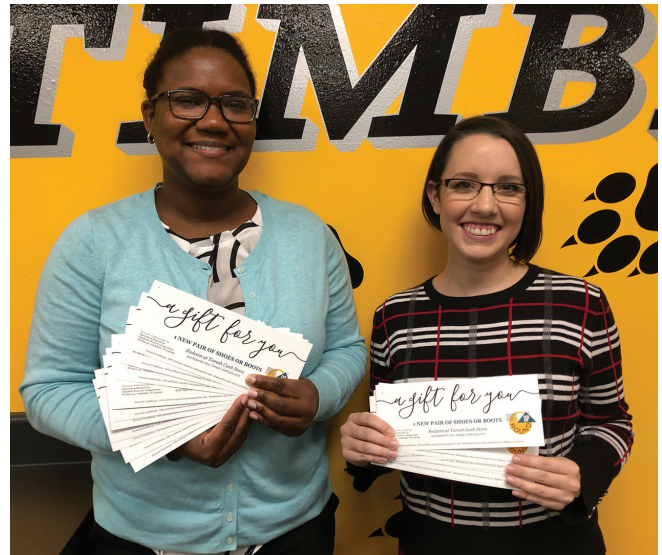
School counselors will identify the students who will receive a certificate for a new pair of shoes.