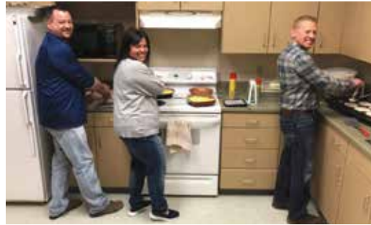
Above: Over 15 different crockpots of soup were donated by employees for the Soup-er Luncheon.